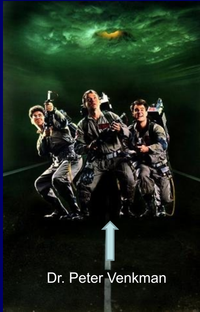
Dr. Peter Venkman